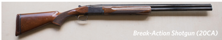
Break-Action Shotgun (20GA)