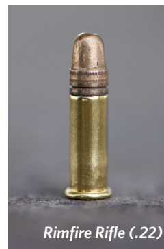
Rimfire Rifle (.22)