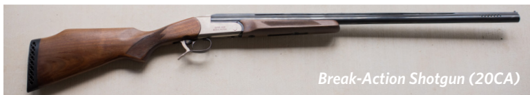
Break-Action Shotgun (20GA)