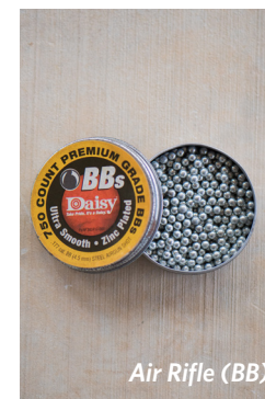
Air Rifle (BB)