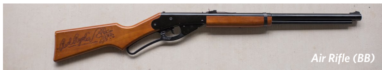
Air Rifle (BB)