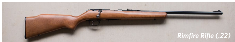
Rimfire Rifle (.22)