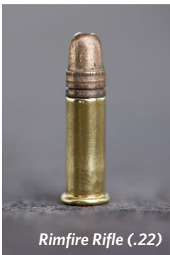
Rimfire Rifle (.22)