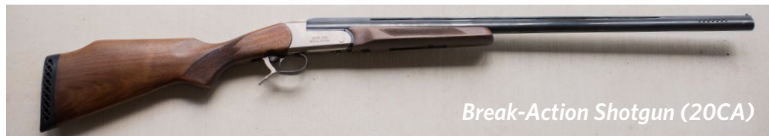
Break-Action Shotgun (20CA)