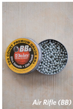
Air Rifle (BB)