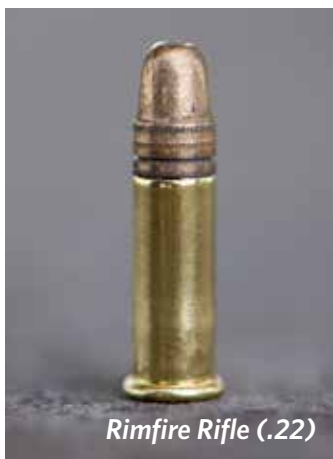
Rimfire Rifle (.22)