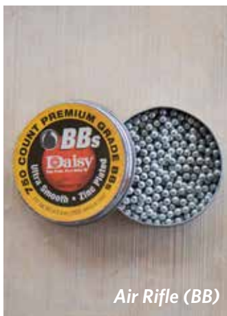
Air Rifle (BB)